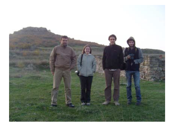
Visiting ancient Kabyle