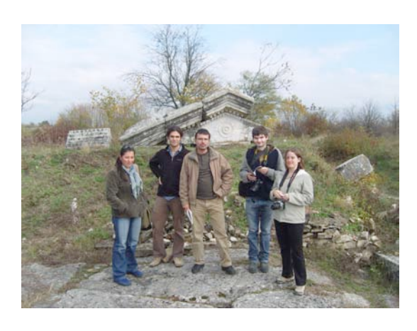
At the agora of Nicopolis ad Istrum