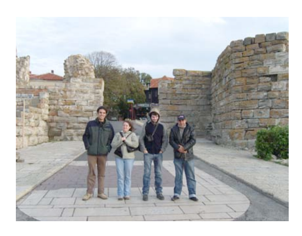
At the windy gate of Mesambria on the Black Sea coast