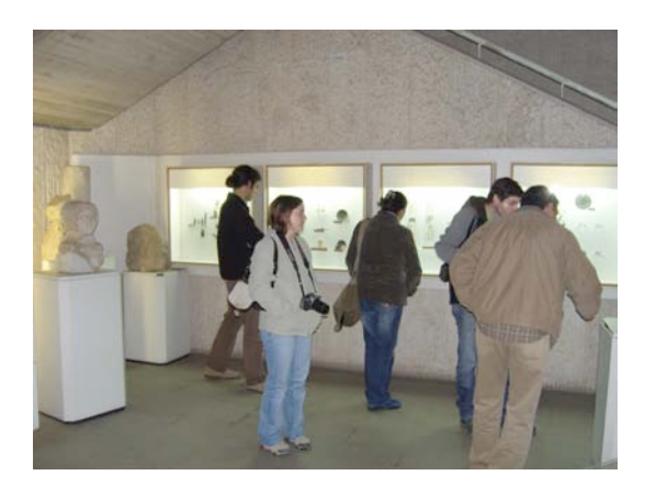
The Regional Museum of History in Vratsa, NW Bulgaria