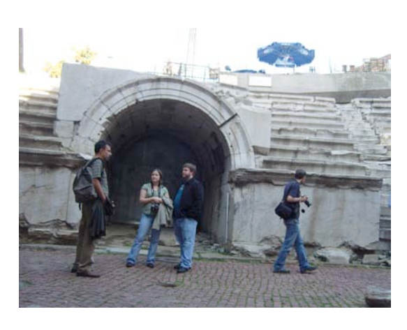
The Roman stadium in Philippopolis