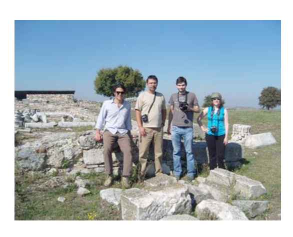
The ARCS group at Amphipolis