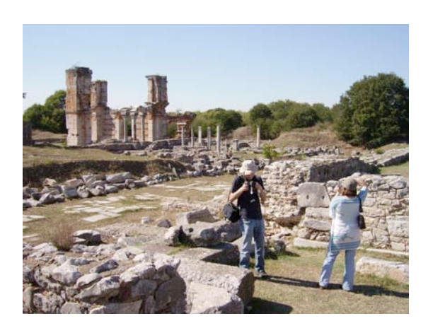
ARCS Fellows taking photos of the impressive remains of Philippi