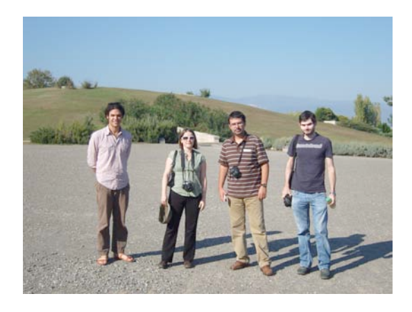
In front of Megali Toumba in Vergina