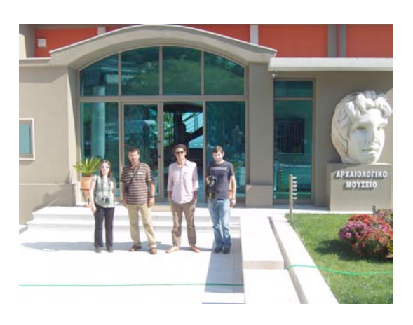
The Archaeological Museum in Veria