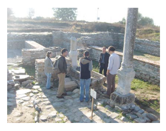
Visiting Nicopolis ad Nestum, SW Bulgaria