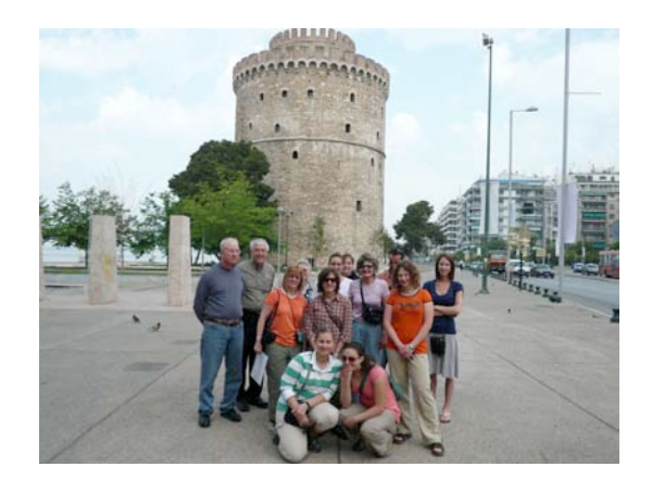
The University of Alaska Anchorage group at the White Tower in Thessaloniki