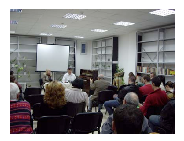
The premiere of Catharsis at ARCS