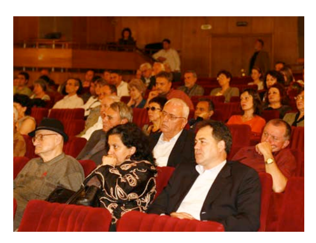
A captivated audience at the premiere of Catharsis, Sofia, Cinema House